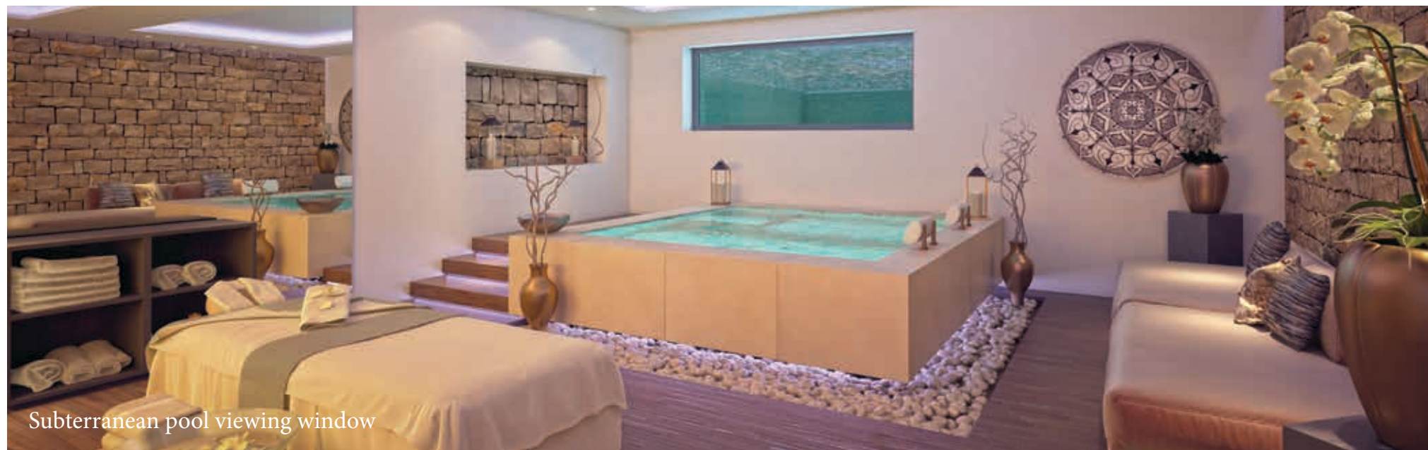
Subterranean pool viewing window