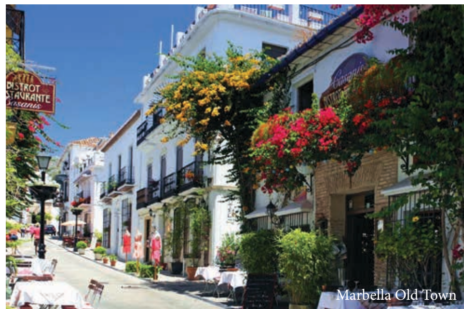
Marbella Old Town