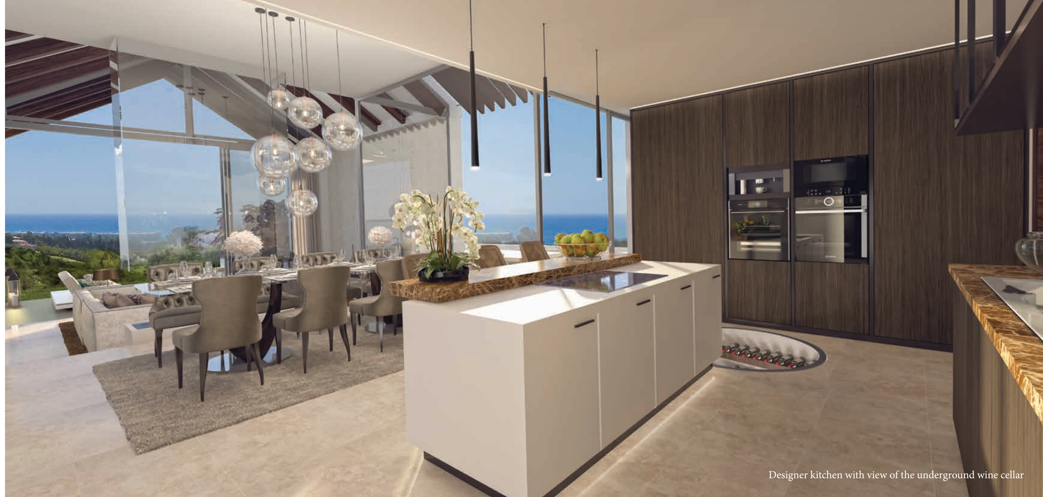
Designer kitchen with view of the underground wine cellar

Natural light will flood every corner of your home with the creative use of glass walls and room dividers.