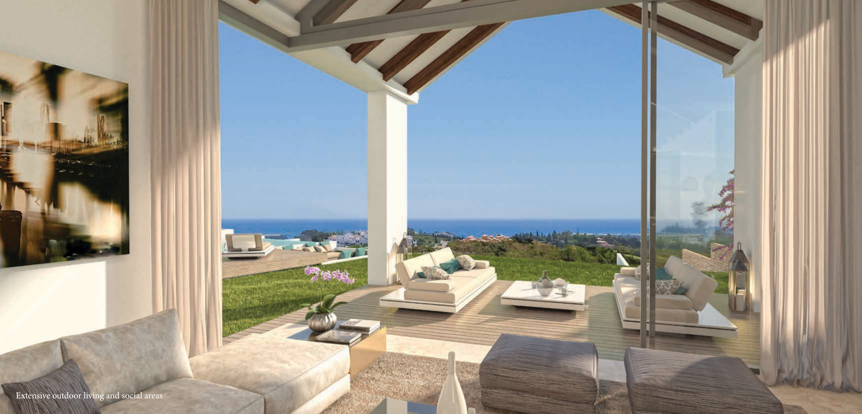
Extensive outdoor living and social areas