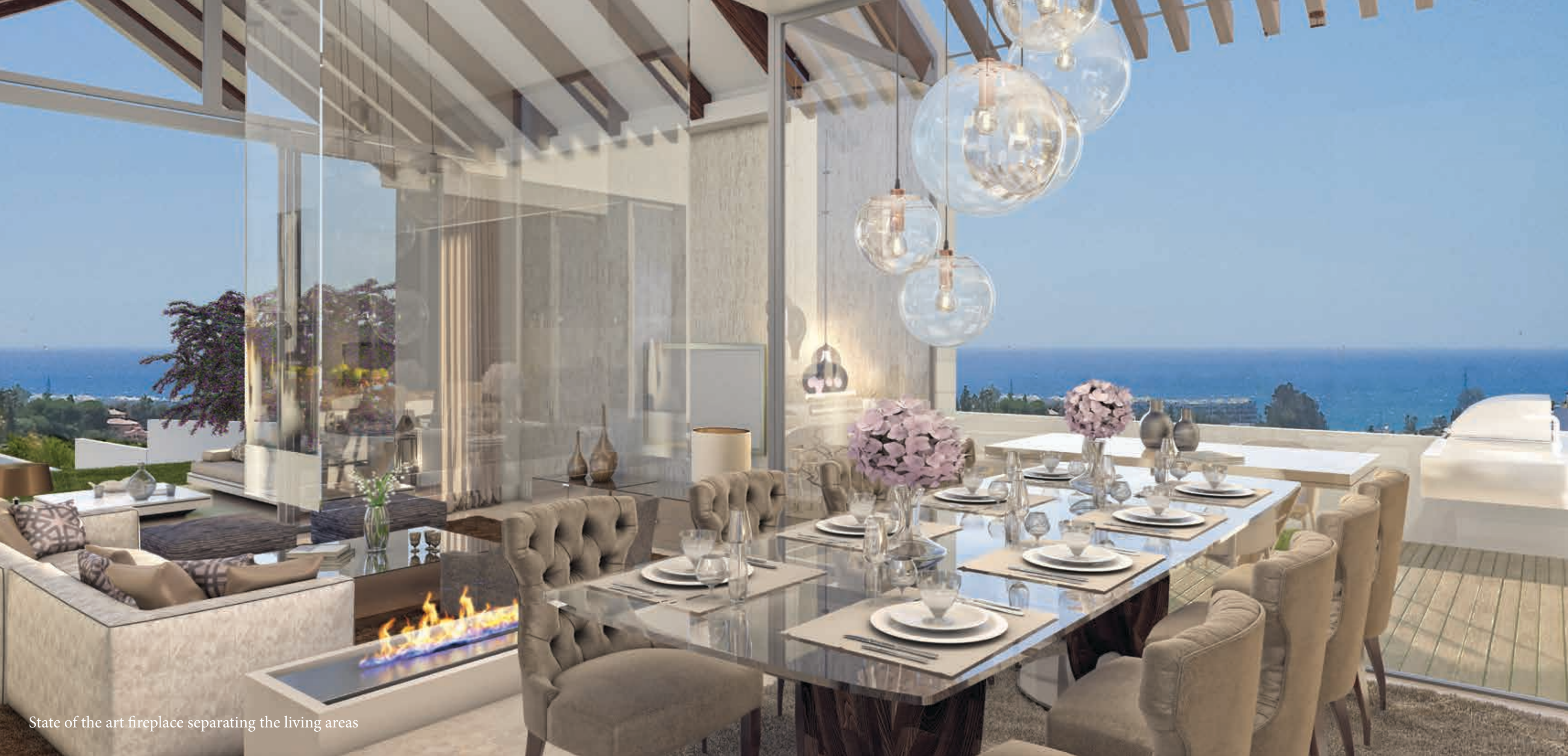
State of the art fireplace separating the living areas