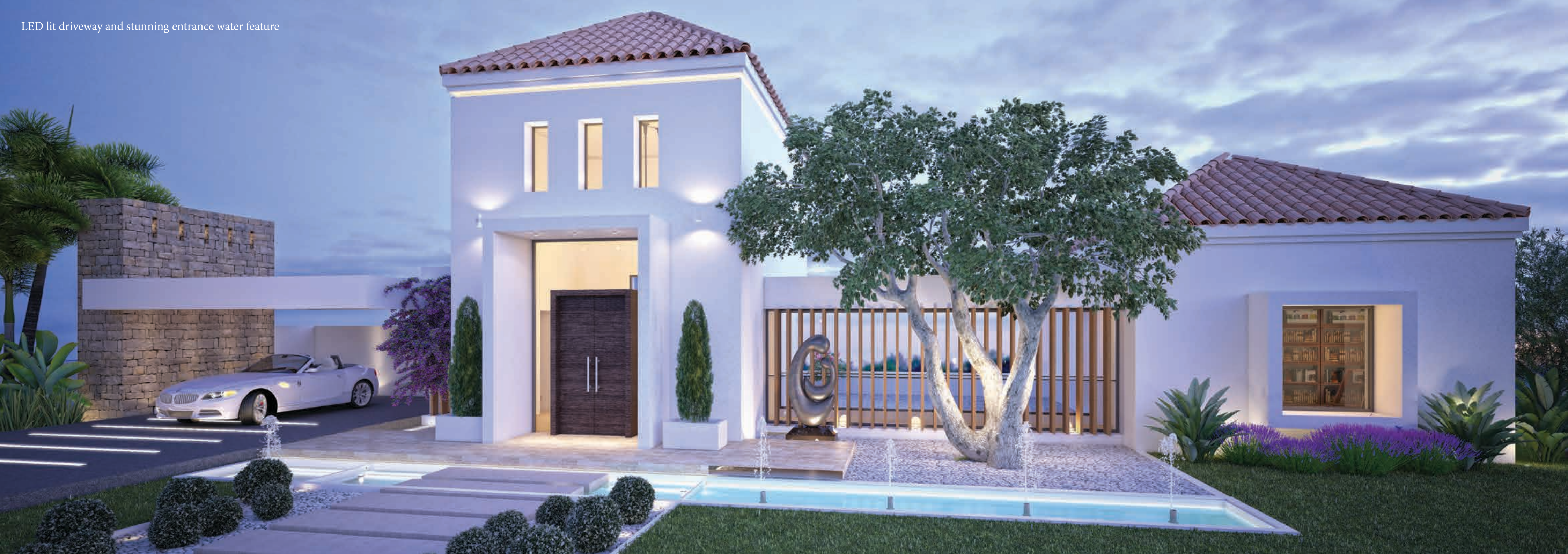
LED lit driveway and stunning entrance water feature