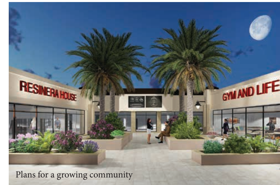
Plans for a growing community