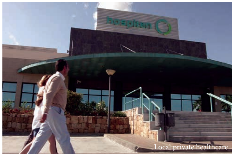
Local private healthcare