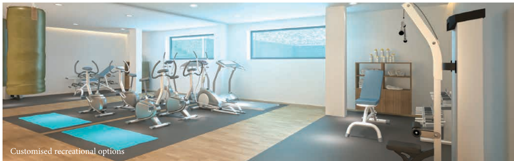
Customised recreational options

Even if work calls, the in-home library and office displays extensive use of light and it's designed to be away from the hub of the main entertainment areas. With high-speed fibre optics, all your office requirements will be available in the comfort of your own home.