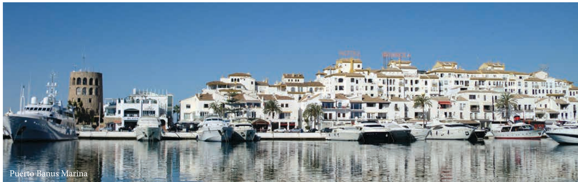
Puerto Banus Marina