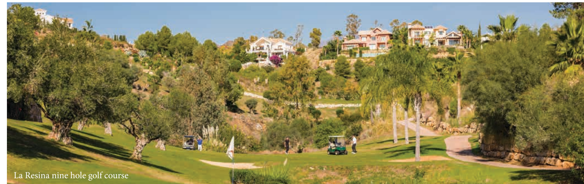
La Resina nine hole golf course