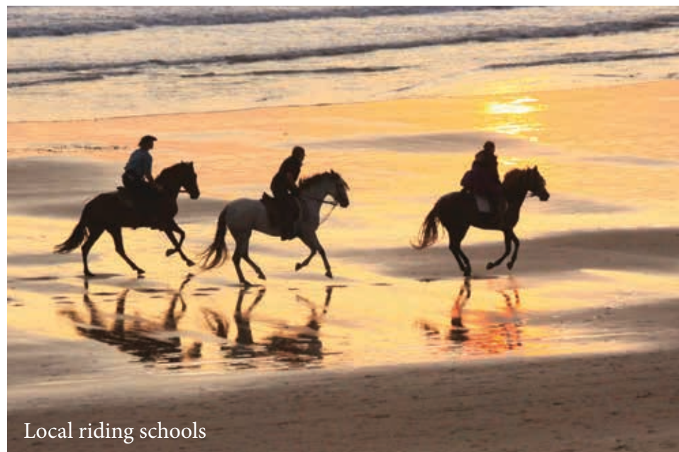
Local riding schools