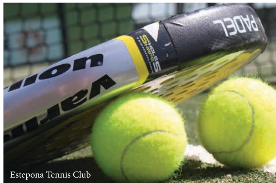
Estepona Tennis Club