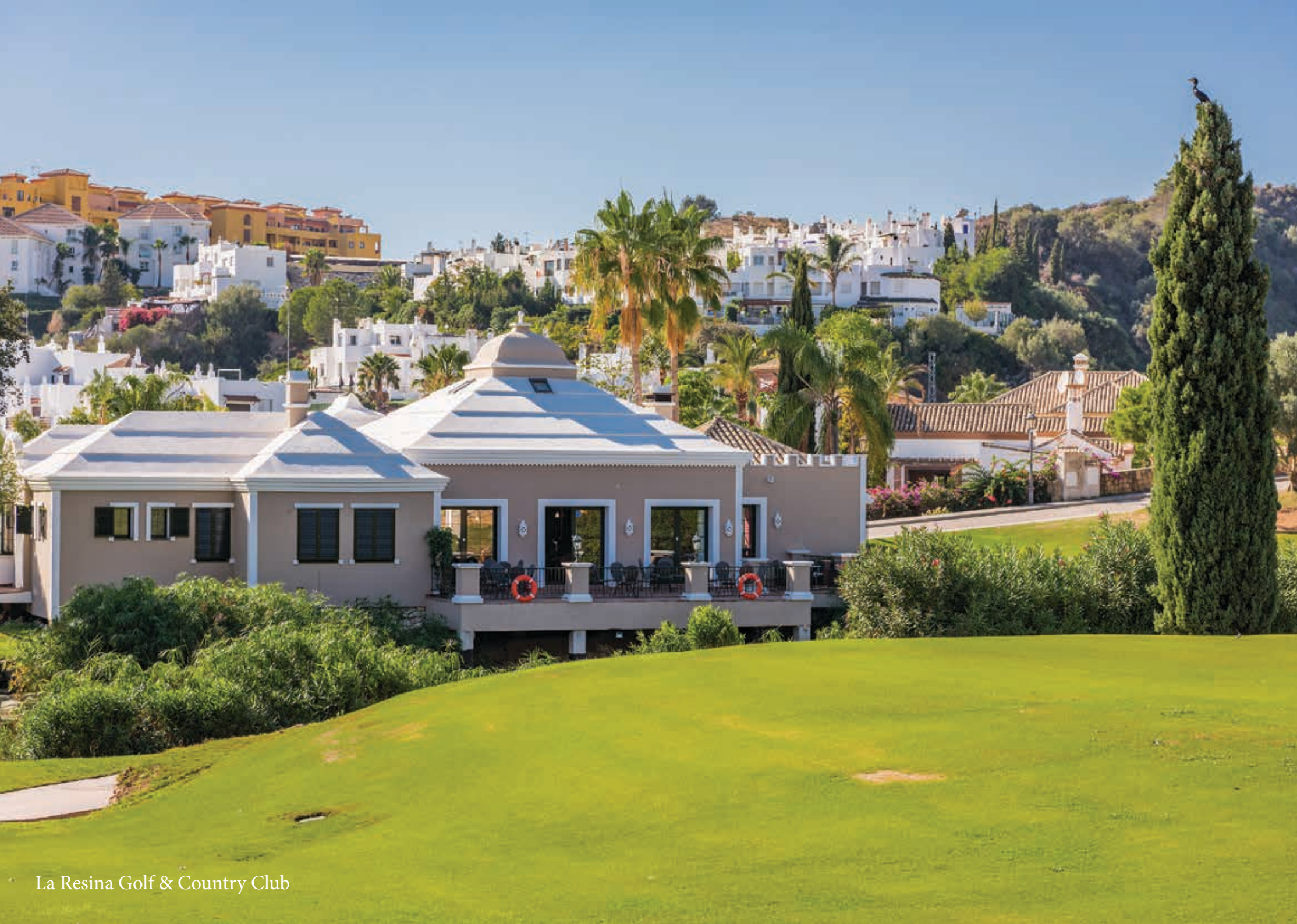
La Resina Golf & Country Club