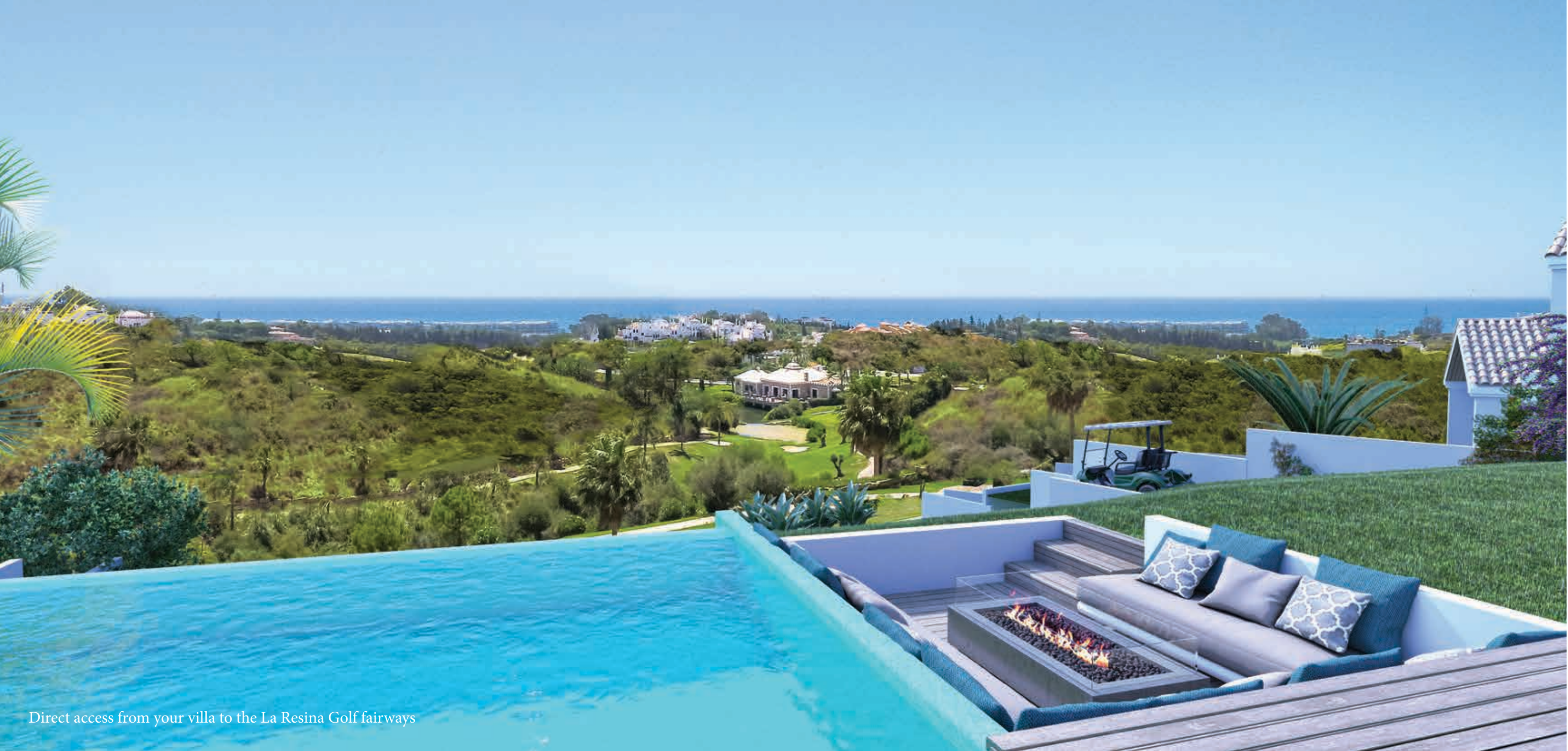
Direct access from your villa to the La Resina Golf fairways